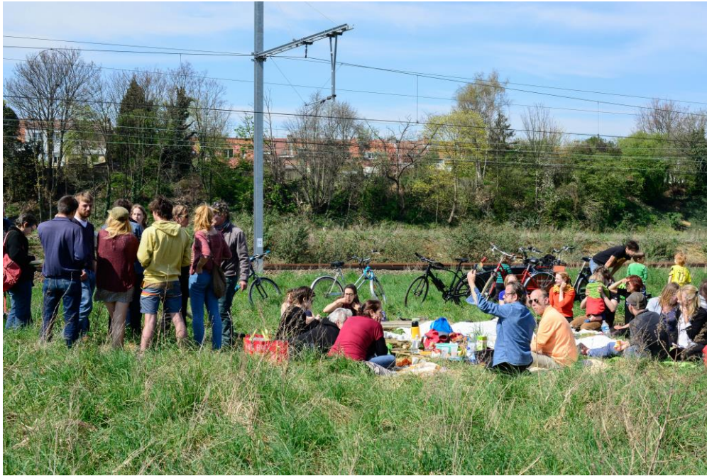
Figure 1. March 2015, picnic the commons , an open debate on and about the Josaphat Ancienne Gare site and its future development is organised by the Commons Josaphat collective.